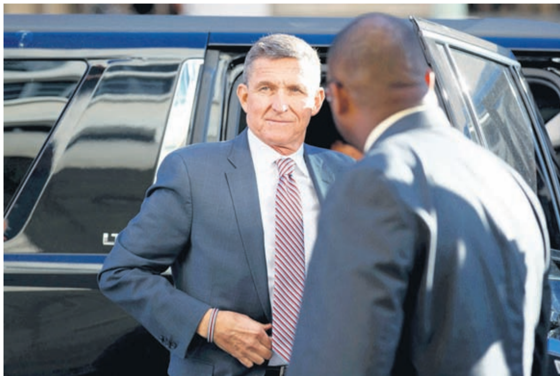
In this Dec. 18, 2018, file photo, President Donald Trump's former National Security Advisor Michael Flynn arrives at federal court in Washington.

Flynn pleaded guilty, as part of special counsel Robert Mueller's Russia investigation, to lying to the FBI about conversations with the Russian ambassador to the United States